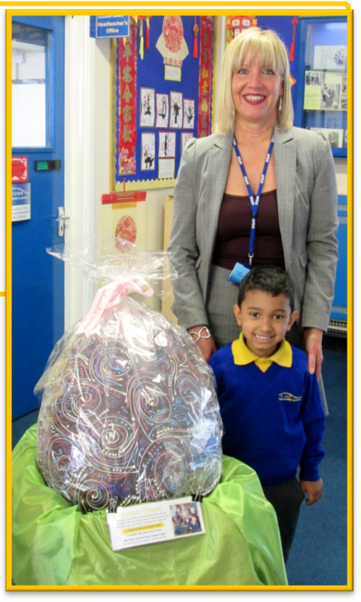
The lucky winner from Opal class pictured with his chocolate egg and the Headteacher outside of her office.